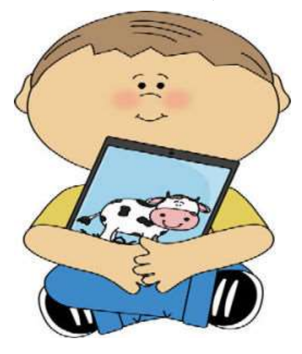
Freeze Cuddle your iPad with both arms